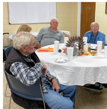
These fellows looked "stumped".

If you have questions, please contact Tamy Munns at 910-274-2506.