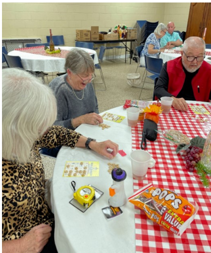
No BINGO yet.

The October gathering was a little more competitive. After a delicious meal, we played BINGO.