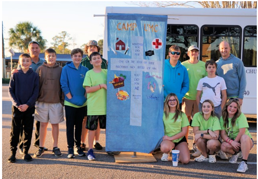
The whole gang

To celebrate the connection the Stock sale created between the youth and our amazing congregation, we will be hosting a spaghetti dinner on Sunday, December 4 th at 5:30PM in the Fellowship Hall for all of our Shareholders. If you missed your opportunity to purchase stock and would like to attend the dinner and hear all the ways God moved in and through our youth, let me know you want to attend so we can plan accordingly for food. It should be a wonderful night of celebration.