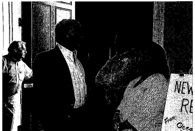
New Member Reception